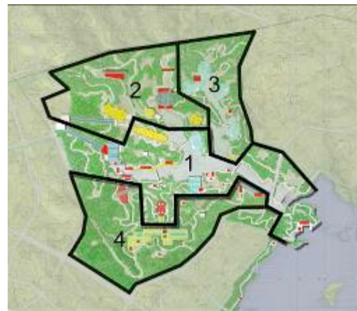
Changshou Lake, China