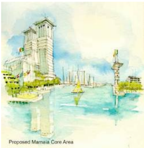
Proposed Mamaia Core Area

Uganda Tourism Master Plan UNWTO, UNDP and Government of Uganda, 2013