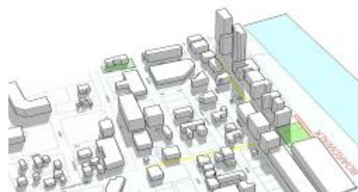
Myrtle Beach, South Carolina

Orissa Coastal Tourism Master Plan, India UNWTO, Government of Orissa, 2007