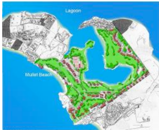
Mullet Bay Resort, St. Maarten

Caymanas Development, Jamaica Private Sector, 2008