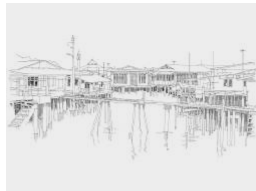
Kampong Ayer, Brunei

Tourism Recovery in Earthquake Affected Areas of Pakistan UNWTO, Pakistan Ministry of Tourism, 2005